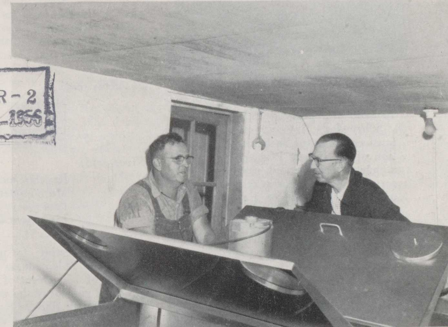
"You can't fight progress."

Three-way Conservation - - - - - Page 12